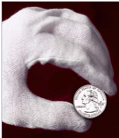
Gloves should be used when handling coins.

Handling: Coins should be held by their edges between thumb and forefinger (see picture). This will protect coin surfaces and designs from fingerprints and the natural oils in fingers or palms that can be corrosive over time. In fact, many experienced collectors prefer to use soft cotton gloves when handling their high-quality Uncirculated or Proof coins. A wide variety of coin holders and albums is available from Littleton for easy viewing and examination of both sides of a coin without actual handling.