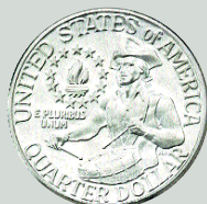
1976 Bicentennial Quarters