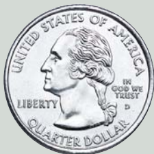
Flanagan's design on the updated obverse was altered to fit in lettering from the original reverse.