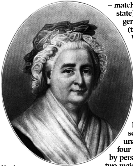
Her heart was at Mount Vernon, but Martha Washington supported George's presidency one hundred percent.

Washington was a very diplomatic man, who commanded the deep respect of both parties and tried hard to remain unbiased. In choosing his first cabinet, he balanced the two parties evenly – matching Thomas Jefferson (secretary of state) and Edmund Randolph (attorney general) against Alexander Hamilton (treasury) and Henry Knox (war).