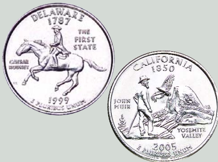
Delaware's Quarter, first in the series, depicts patriot Caesar Rodney racing to vote for independence. California's was the first 2005 Quarter design.