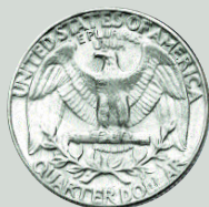
1965-1998 Washington Quarters