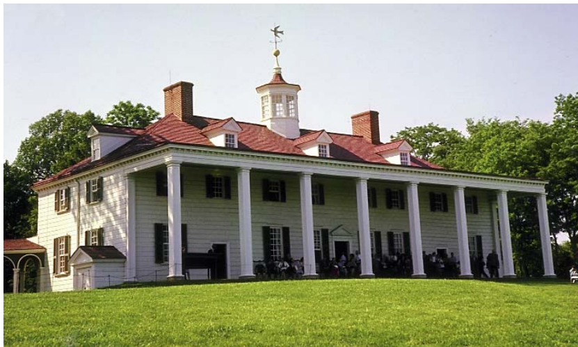
Mount Vernon, Washington’s stately Virginia home, was his favorite place.

For the next 20 years, Washington’s life happily revolved around events at Mount Vernon. Six days a week, he rose early and worked exceedingly hard. Sundays he would attend church (irregularly), and pursue some of his varied interests. These included entertaining, foxhunting, riding, training colts, and even wrestling! He loved billiards and card games. And not only did he support several racing associations, but he also ran his own horses in races.